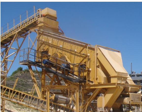
Trio® inclined wet screen operating at a plant in Central America

Our Trio® screen range is designed for versatile screening and reliable gradation in a broad range of multi-product, secondary and final sizing applications. The machine can be integrated within aggregate processing, hard rock mining, minerals screening, environmental mitigation, and recycling separation processes.