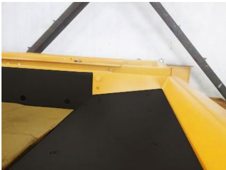
Abrasion Resistant (AR) steel wear parts lining the feed box and discharge lips